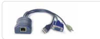
Example CAM: CATX-USB-A

Master Power Switch for connection to AdderView CATx IP or standalone Ethernet operation: PSU-8MASTER