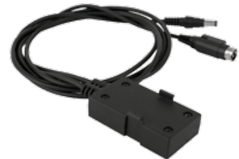
Above: PSU-RPS-5V. 12V to 5V converter power adaptor

VSC48: 2m 3-pin locking to 3-pin locking power lead PSU-RPS-5V: 12V to 5V converter power adaptor RMK4D-R2: Rack mount bracket with holder for power adaptor (PSU-RPS-5V) PSU-RED-460W: Additional 460W power module