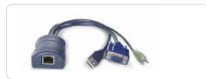
Example CAM: CATX-USB-A

Master Power Switch for connection to AdderView CATx IP or standalone Ethernet operation: PSU-BMASTER