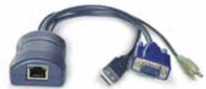
Example CAM: CATX-USB-A

1000 or standalone Ethernet operation: PSU-8MASTER