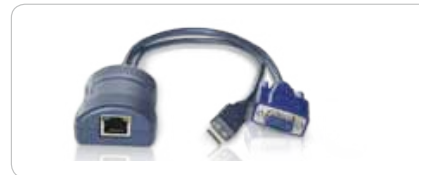
Example CAM: CATX-USB

CAM: Computer Access Modules: CATX-PS2 (PS/2 only) CATX-USB (USB only) CATX-SUNA (Sun plus audio)